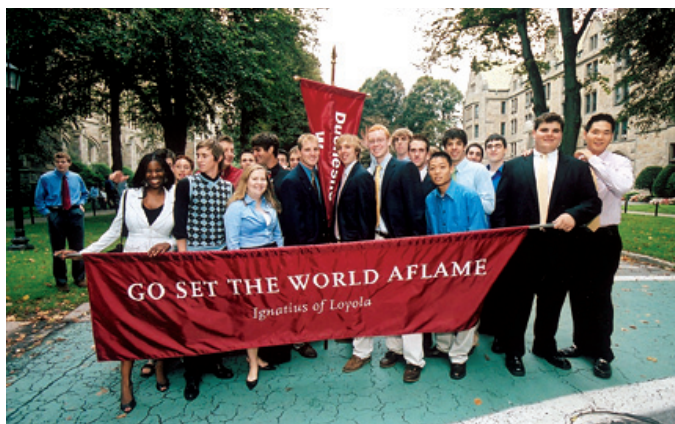
First Flight First Year Convocation