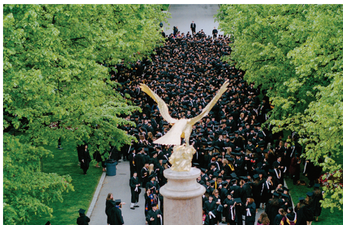
Graduation Lineup on Linden Lane.